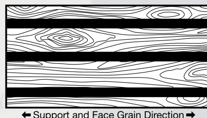
8' Parallel to supports

Note: Applicable for plywood across two or more spans, and on supports at least 1.5" wide Load Tables developed by APA: The Engineered Wood Association